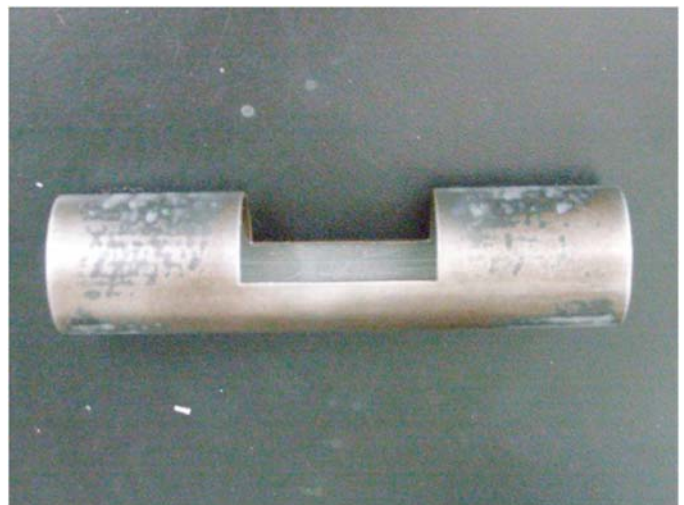
FIG. 2 Cylinder Configuration

covering as directed in an applicable material specification or other agreement between the purchaser and the supplier. Consider the rolls, or pieces, of pile yarn floor covering to be the primary sampling units. In the absence of such agreement, take one roll or piece from the lot to be tested.